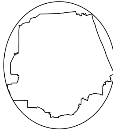
(b) Enacted District 6